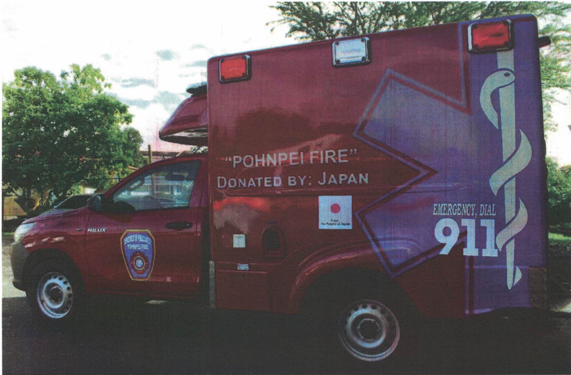
Exhibit IV Left Side of the Ambulance Type 1 Hilux Toyota