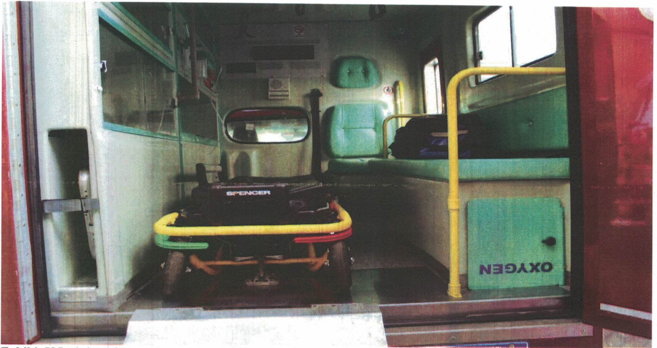
Exhibit V Interior of Ambulance Type 1 Hilux Toyota