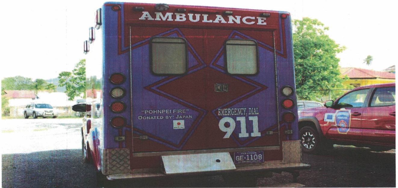
Exhibit I Rear View of Ambulance Type 1 Hilux Toyota (GE 1108)