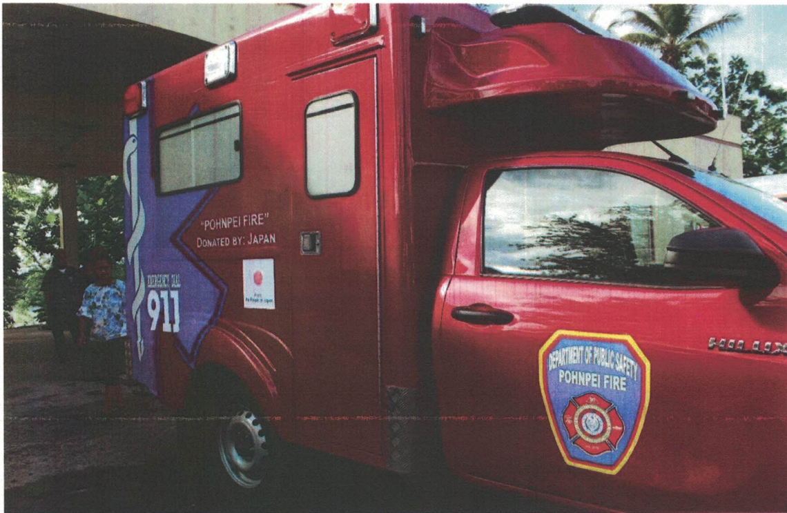
Exhibit III Right Side of the Ambulance Type I Hilux Toyota