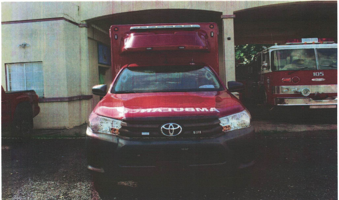
Exhibit II Front View of Ambulance Type I Hilux Toyota Exhibit II