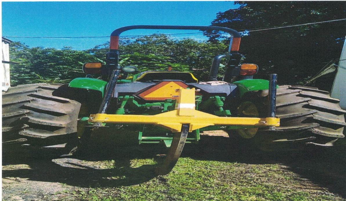
Rear side of tractor no 1.