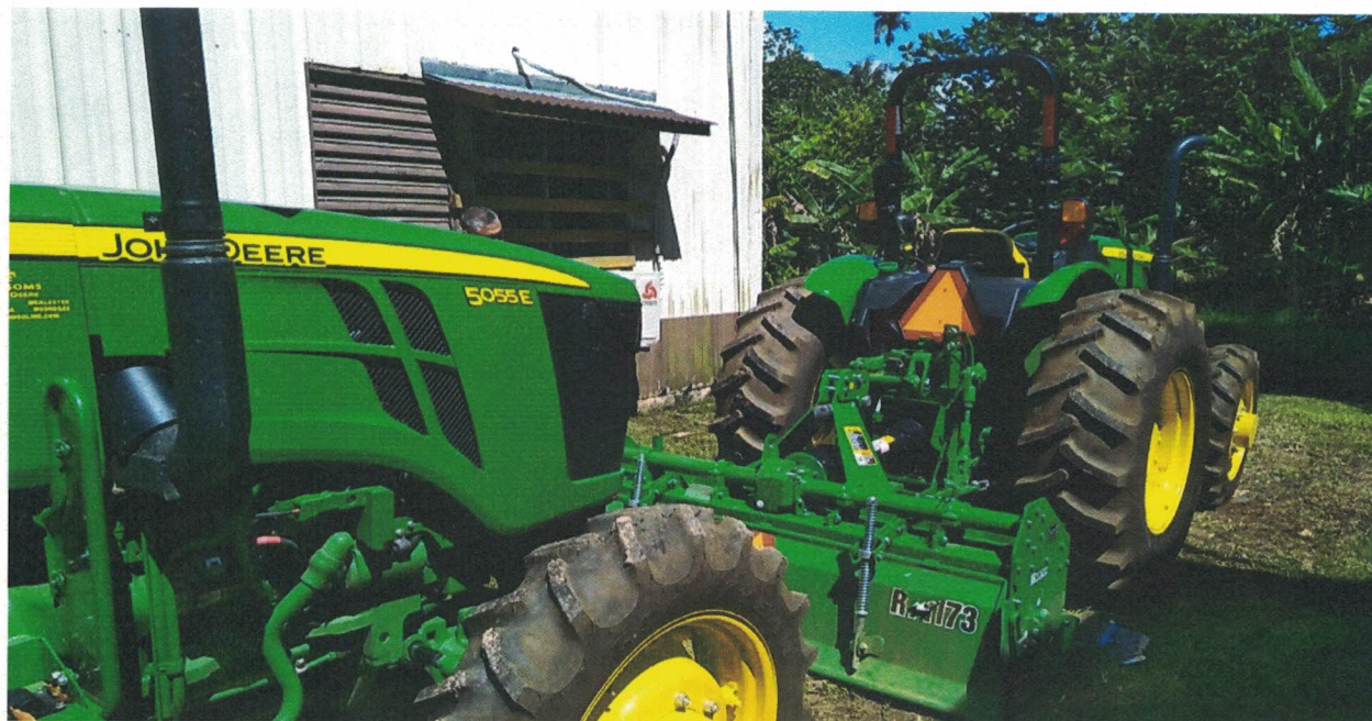
Rear side of tractor no.2 and partial right side of tractor no. 1