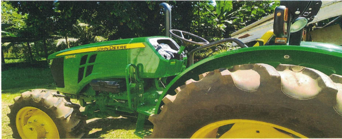
Left side of tractor no 1.