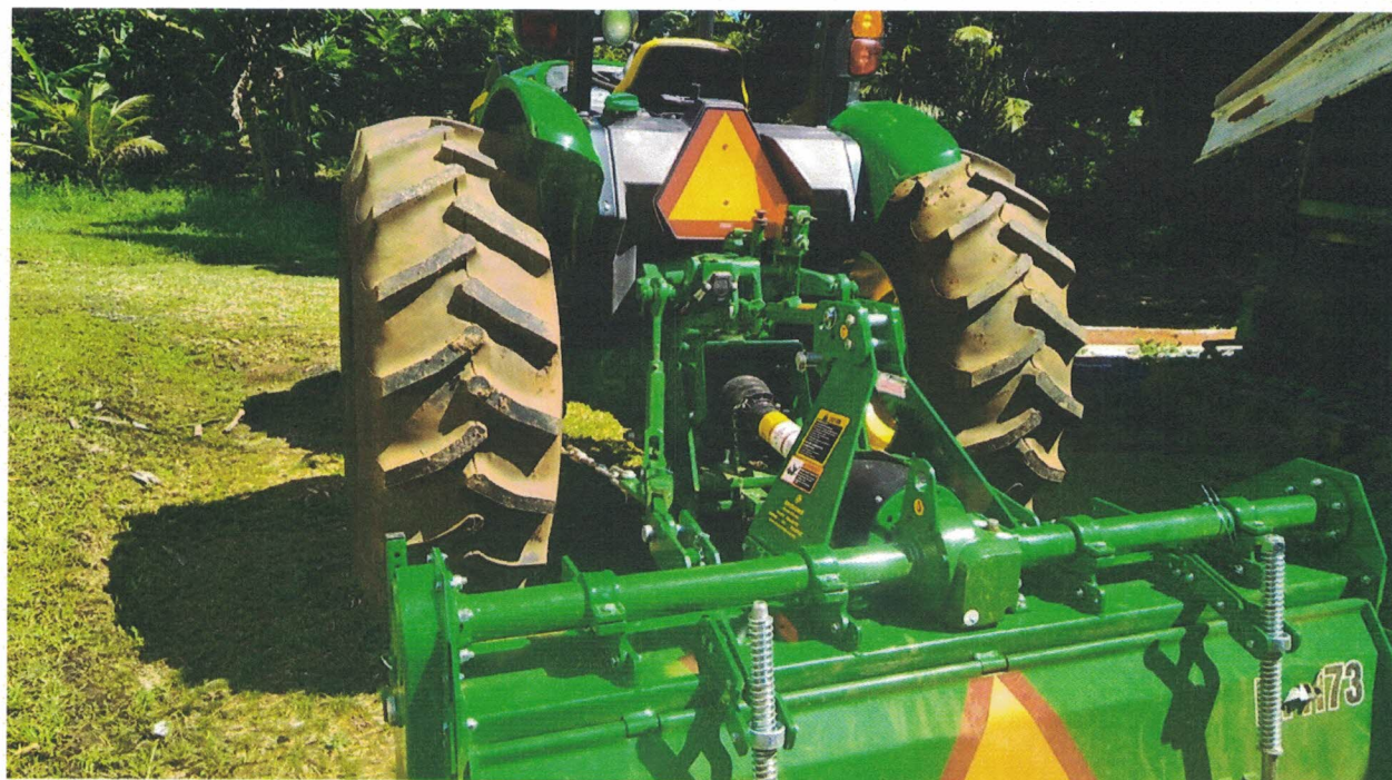
Rear side of tractor no.2